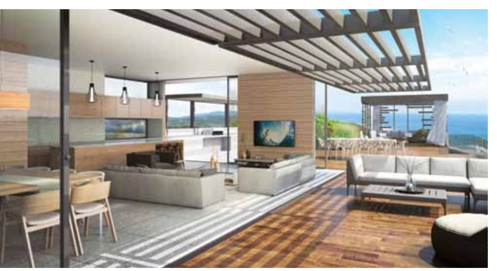
The information herein is for illustration purposes only and is subject to change without prior notice